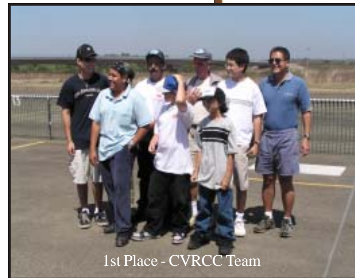
1st Place - CVRCC Team