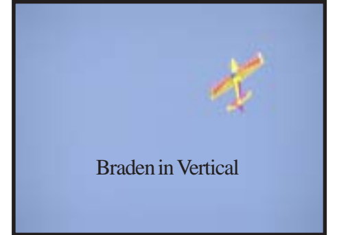
Braden in Vertical