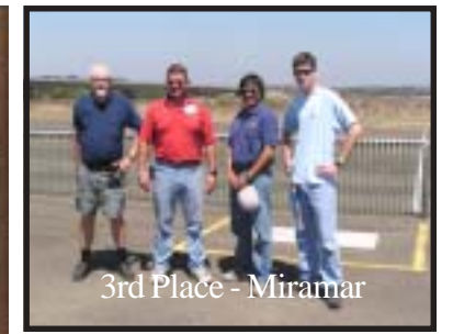
3rd Place - Miramar