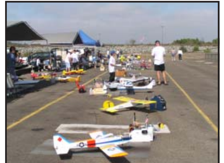
Pits and County Fun Fly No. 1