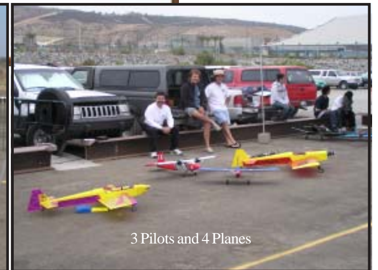
3 Pilots and 4 Planes