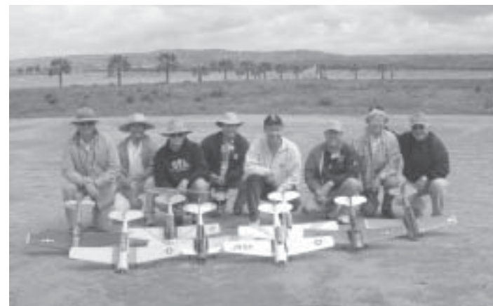
Next Month' Cover

This month we are going to show highlights of the MWE! We will also talk about the pro's and con's of the event. I will have lot's of photos, movies and some cool show and tells! Big raffle prizes! Please remind people about the meeting and bring a friend!