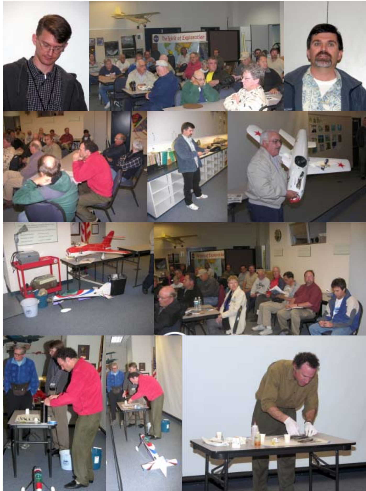
Silent Electric Flyers of San Diego