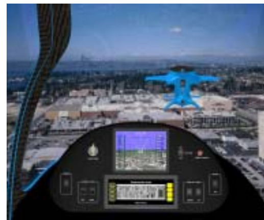
Here's what you could be looking at instead of that nasty, four lane gridlock!