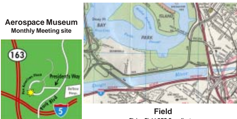
Aerospace Museum Monthly Meeting site Flying Field GPS Coordinates AMA Charter Club 3078 Latitude 32.7626416 N Longitude 117.2143138 W web site: http://sefsd.org/ Zip Code 92109

Two more imaginative VTOL vehicles appear on the back cover.