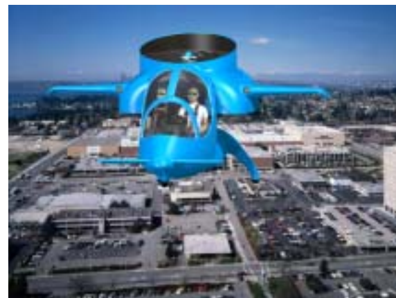
Our commute was . . . well, you can see how ours was.